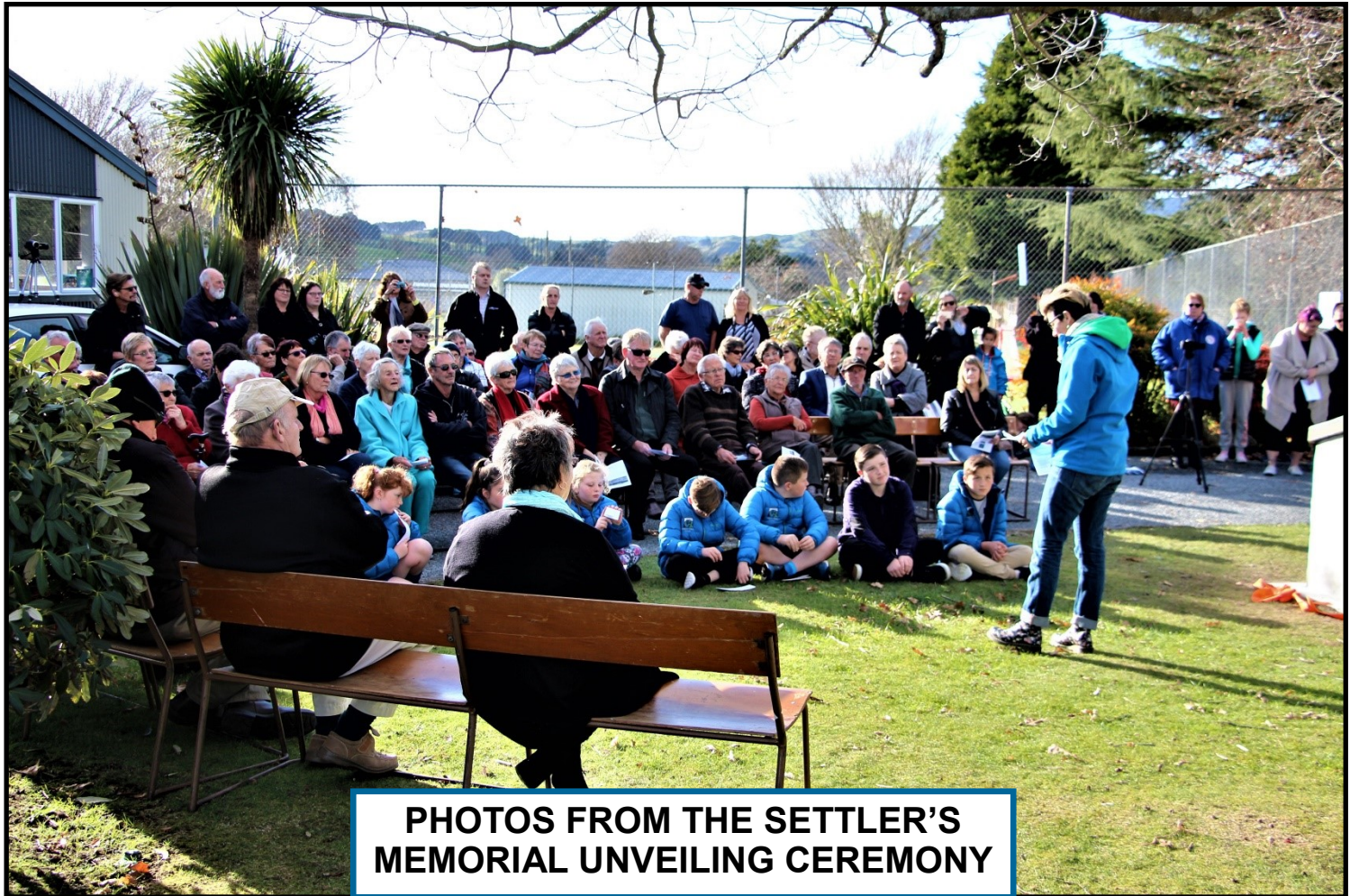
PHOTOS FROM THE SETTLER'S MEMORIAL UNVEILING CEREMONY